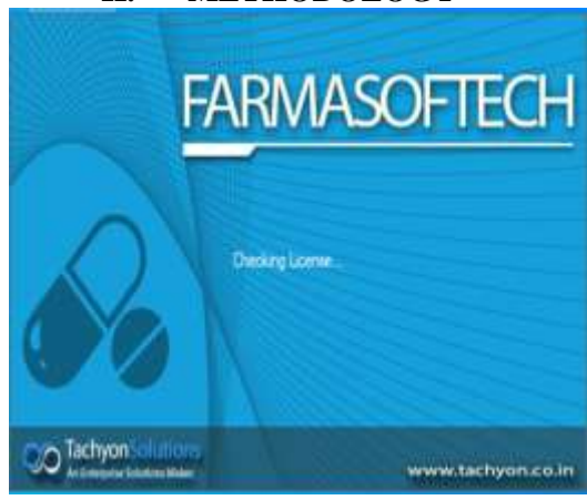
Step1: Evaluation of existing software.

The study was started by evaluating the existing software in the market. Most of the software in the market has number of problems. The main drawback of the software handled in the year end, which related with the accounting section. The trail balance, repeated orders, dead stocks, accurate expiry forecasting delay in the supply and fixing appropriate orders are the main problems in a pharmacy. That is minimized by the use of software in an extent.